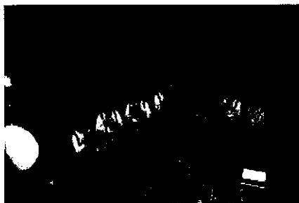
Ameriikan Poijat performs June 4

"Finnish Brass in America" features a variety of musical forms (waltz, polka, march, tango, schotische, etc.); "Connections Finnish" also has a variety of musical forms, both dance music and concert pieces. Each CD costs $15 (includes tax), plus $3.00 handling and $1.00 postage, for a total of $19. Indicate which CD you want and send check or money order payable to IHRC.