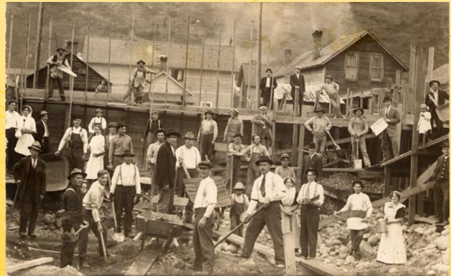
Finnish workers hall

With the success of this project, the IHRC began to expand its collection from the late 19 th and early 20 th century by collecting archival material from areas outside the Iron Range. During this period, a record number of immigrants from Central, Eastern, and Southern Europe arrived in the United States. Simultaneously, large amounts of people from the Near East, such as Syrians and Lebanese, immigrated to the United States as well. This time period would become one of the largest eras of migration to the United States. Due to the massive amount of material collected by the IHRC from these people during this time period, this era of immigration has become the IHRC's specialty.