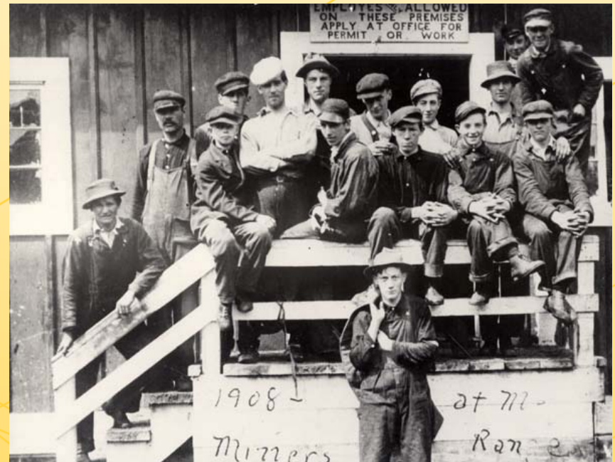
Tyomies Society (Photographs), Records

Another of the IHRC's largest collections is of materials coming from the Baltic migrants after World War II. Prior to the war, many of the people had to side with Nazi Germany in order to survive. As a result, once the Allied Nations won the war and the Soviet Union gained control of this territory, many Baltic people were not safe living in their homeland and immigrated to the United States. However, unlike other migrants, the Baltic people were refugees due to the war and one day hoped to return to their homeland once it became safe. As a result, the IHRC has a large collection of materials documenting how their experiences differ from those of other immigrants.